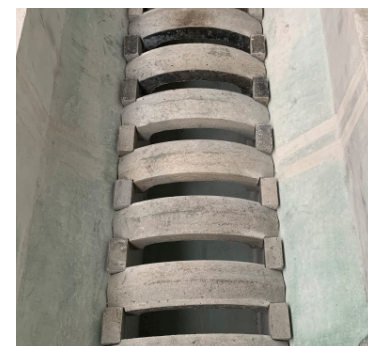
Hearth Bars View