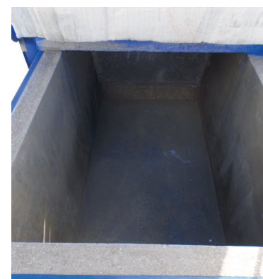
Internal Chamber View