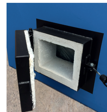
Optional: Ash Door View