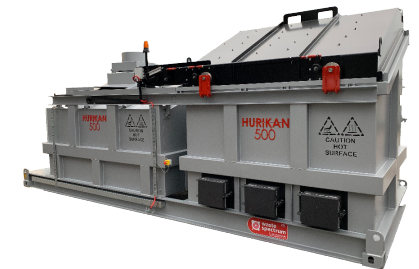
Optional Static Model