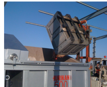
Image illustrates suggested loading method