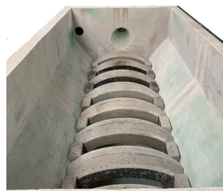
A wide chamber will help to maximise load capacity and allow for easier loading.