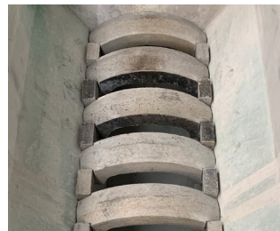
The unique hearth bar technology allows for efficient incineration from above and below.