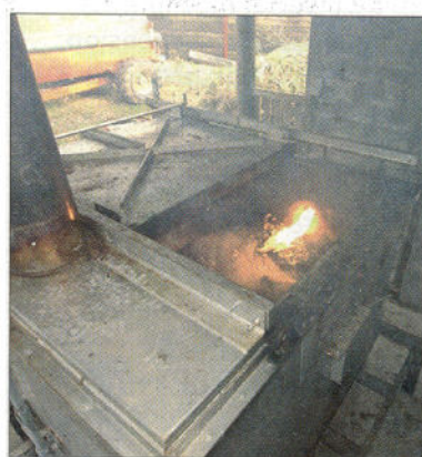
The incinerator will dispose of up to 300kg in six hours at a cost of between £3 and £5.